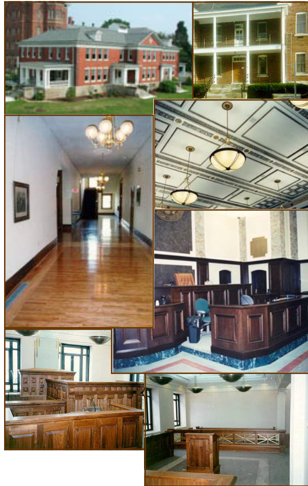
Other restoration project photos

In addition to doing it well; we do it competitively.